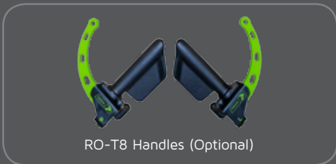
RO-T8 Handles (Optional)

The unique swivel design of these handles yields a drastic increase in output potential on select exercises when executing bilateral cable work on our Functional Trainer. The RO-T8 Handles are available in two color options: PRIME Green or Black.